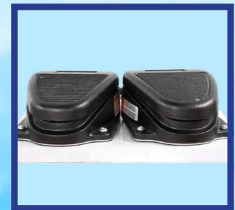
Separate wiper & spray pedals