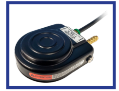
Foot pedal controlled!