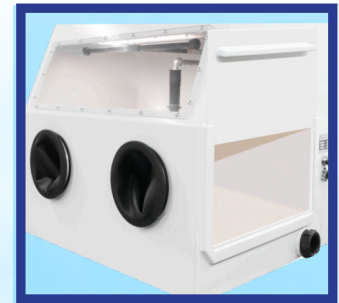
Wide access areas on both sides