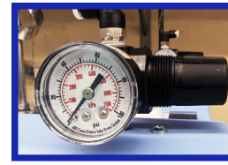
Adjustable pressure gauge!