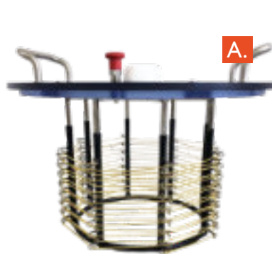
A. Chain Holder with Gear Drive

Process several 25 meter chains in one cycle