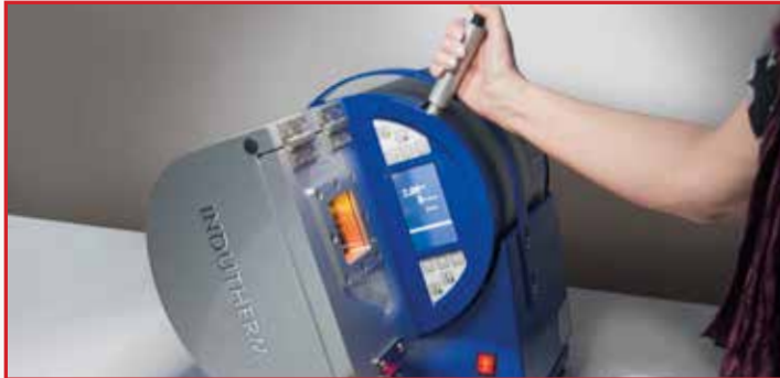
Pouring off is simple and easy, and takes place using a 90° rotation of the casting unit.