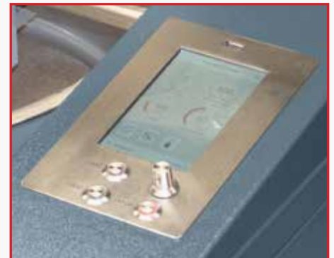
Touch Screen display for easy control of all functions