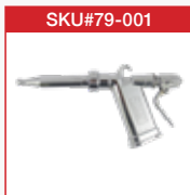
Hydro-Air Pressure Washer Gun