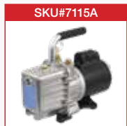
3 CFM Vacuum Pump