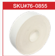
Non-Asbestos Paper Roll 2.5" x 1/16" x 75'