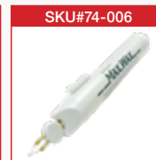
Max Wax Speed Pen