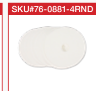
10 Non-Asbestos Paper Bases - 4" OD x 3 1/4" ID