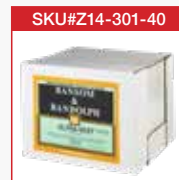
Ranson & Randolph Ultra Vest Investment - 40lbs