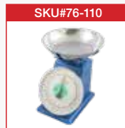
Investment Scale 0-10 lbs