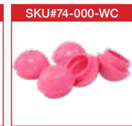
Platinum Wax Mushroom Base 5 Pack