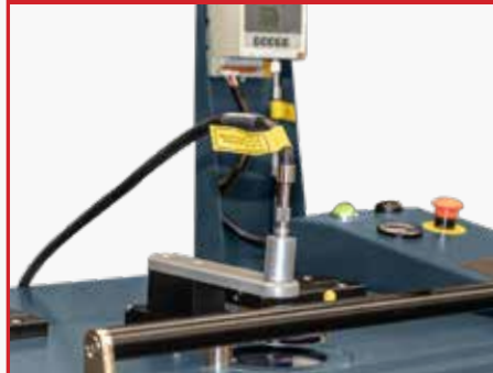
Optional Dual Spectrum Optical Pyrometer