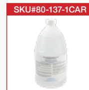
J-Break Platinum Investment Remover