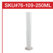
250ML Graduated Cylinder