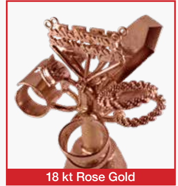
18 kt Rose Gold