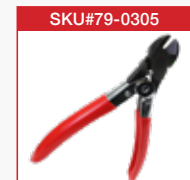
Maun Sprue Cutter 6.5" / 165mm length