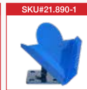
Adjustable Sprue Base Holder