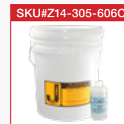
J-Formula "606" Platinum Investment