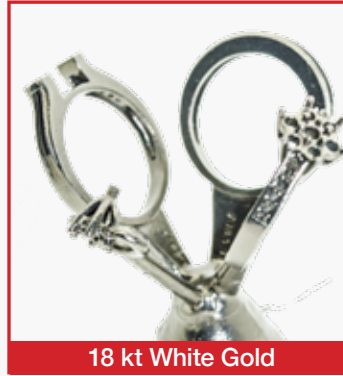
18 kt White Gold