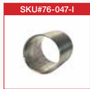
Stainless Steel Flask 80 x 80mm / 3" x 3" 12 Gauge