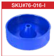
Cone Style Sprue Base 80 mm / 3"