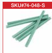
Wax Sprue Rods 6" x 3/8" Stiff 45 rods per lbs.