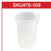
3 Liter Measuring Pitcher