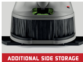
ADDITIONAL SIDE STORAGE