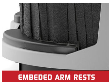
EMBEDDED ARM RESTS