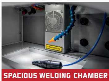
SPACIOUS WELDING CHAMBER