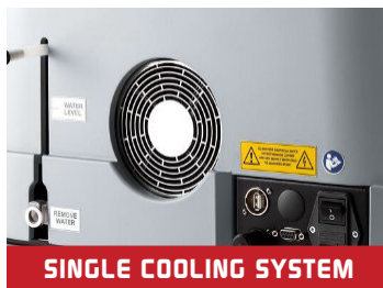
SINGLE COOLING SYSTEM